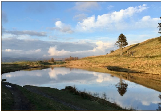
Tiny School Knott tarn with its little islands of cuckoo flowers