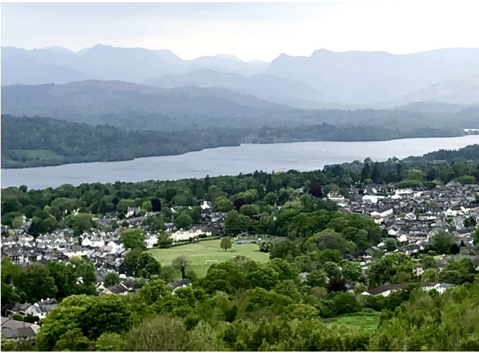
Stunning views from the top of School Knott. The terrace row with Running Hare is to the left of the park.