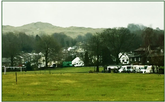
Knobbly School Knott viewed from Queen's Park